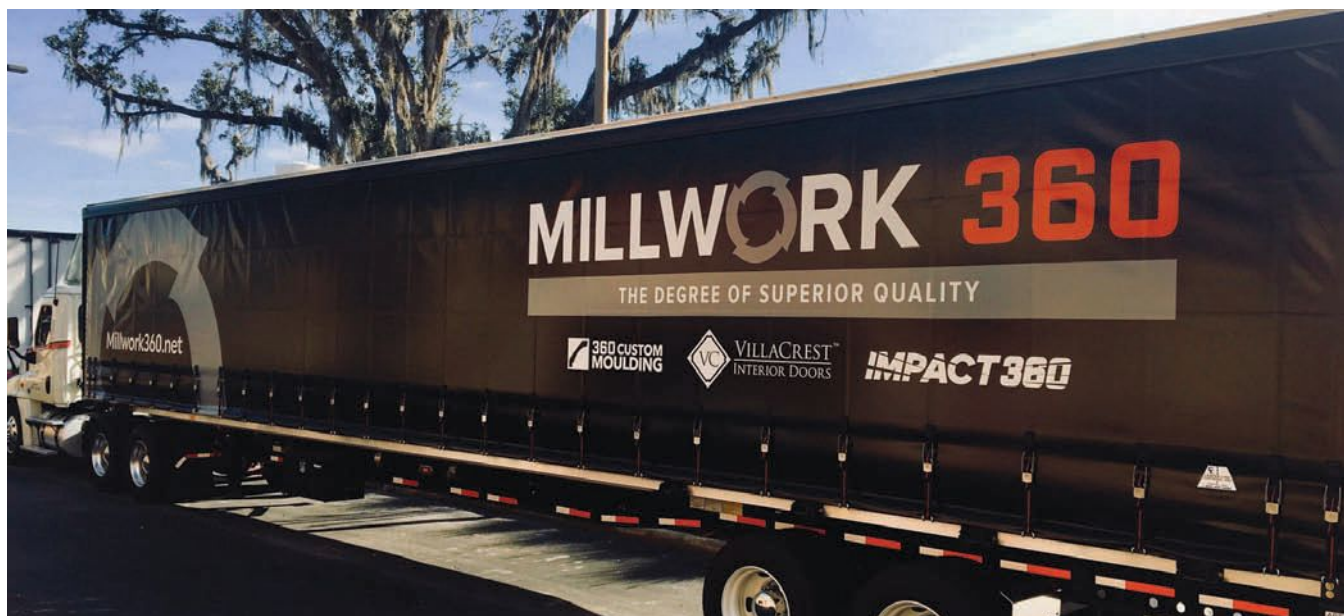
Millwork 360 has grown to $13 million in a short 10-year period by producing a consistently high-quality product and delivering as promised.