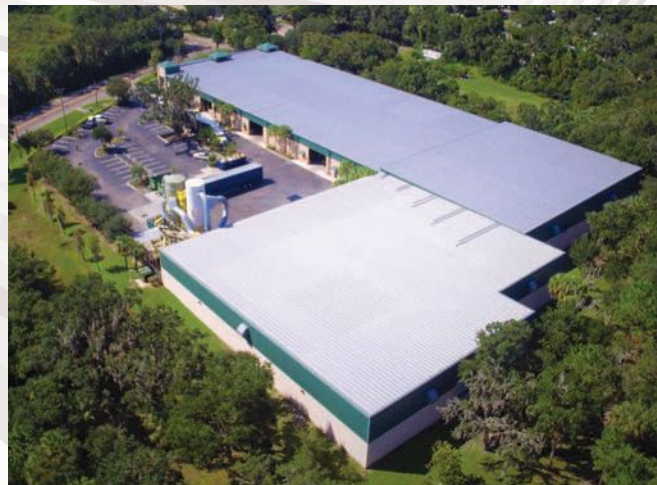
Millwork 360's facility in Tampa encompasses 80,000 square feet.